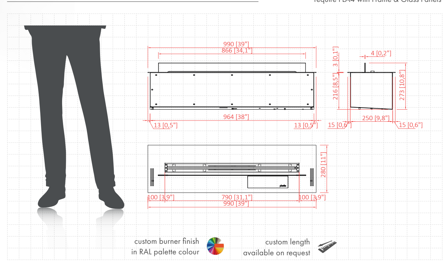
Freestanding, Room Divider, Tunnel and Island housings require FLA4 with Frame & Glass Panels

All product specifications and data are subject to change without notice and are believed to be accurate as of the date hereof. Planika Sp. z o.o., its affiliates, agents, and employees, and all persons acting on its or their behalf (collectively, "Planika Sp. z o.o."), disclaim any and all liability for any errors, inaccuracies or incompleteness contained in any document or in any other disclosure relating to any product. To the maximum extent permitted by applicable law, Planika Sp. z o.o. disclaims any and all liability arising out of the application or use of any product. No license, express or implied, by estoppel or otherwise, to any intellectual property rights is granted by this document or by any conduct of Planika Sp. z o.o. Customers using or selling Planika Sp. z o.o.'s products not expressly indicated for use in such applications do so entirely at their own risk and agree to fully indemnify Planika Sp. z o.o. for any damages arising or resulting from such use or sale. The provided fuel consumption is based on laboratory testing on the lowest flame level. The actual consumption of individual devices may vary. The images are indicative only.